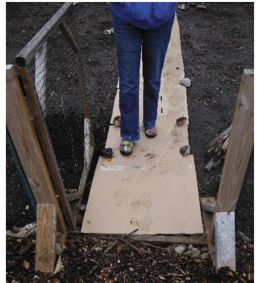
Save those plain brown cardboard boxes to serve as paths through your vegetable garden

Include herbs such as thyme, sage, oregano and dill in your vegetable garden and flower beds. Many herbs repel foraging animals. Dill attracts and is a host plant for a number of butterflies (like the black swallowtail shown above), so be prepared to sacrifice a branch or two of the vigorous plant to their caterpillars in exchange for their beauty. Thyme makes a great ground cover for hot dry area, especially on slopes where mowing may be tricky.